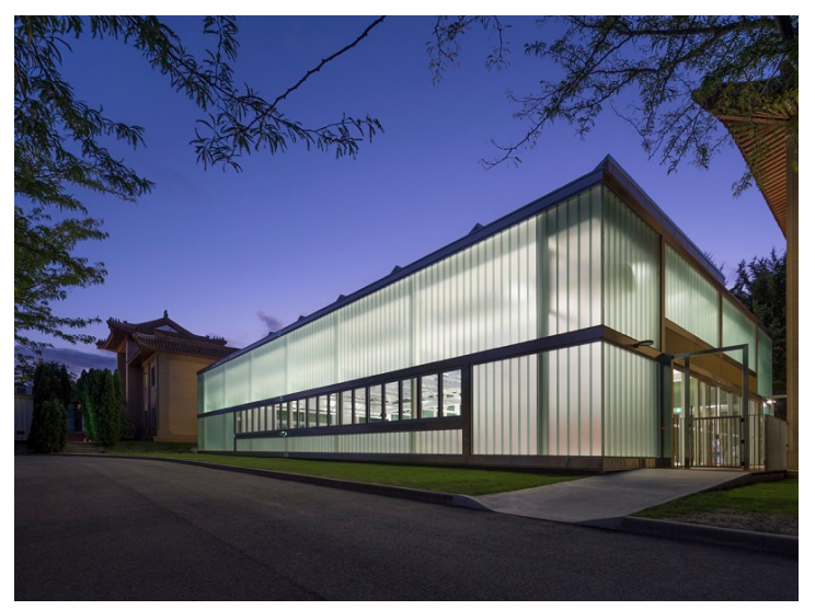
Architect: Townsend and Associates Architects PTY LTD | Build: Manteena