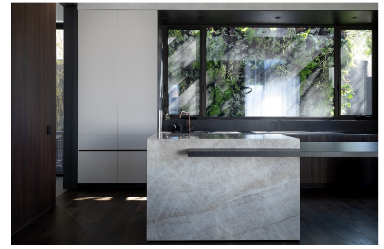
Architect: Wolf Architects | Build: Leone Constructions