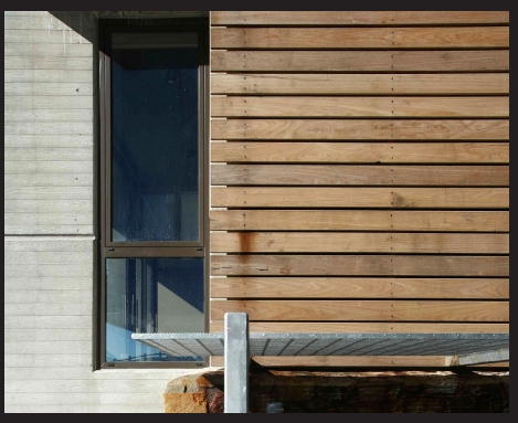
Architect: Salter Architects | Builder: L.U Simon