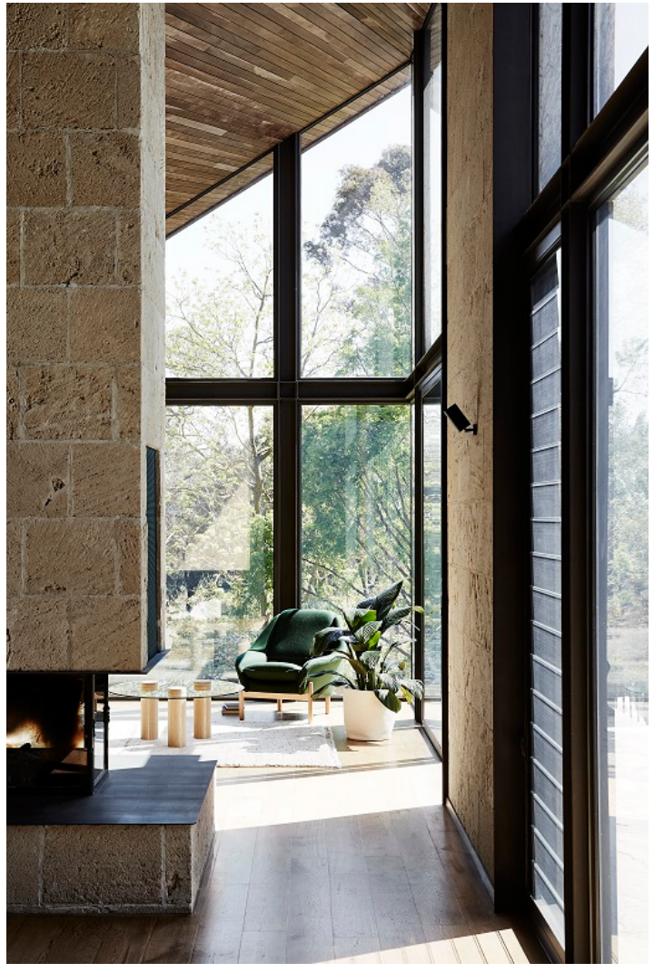
Architect: Clare Cousins | Builder: BP Pro Built