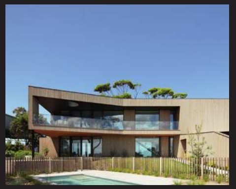
Architect: Inarc Architects | Builder: Vcon Builders