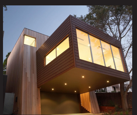
Design: Vibe Design | Build: Icon Synergy